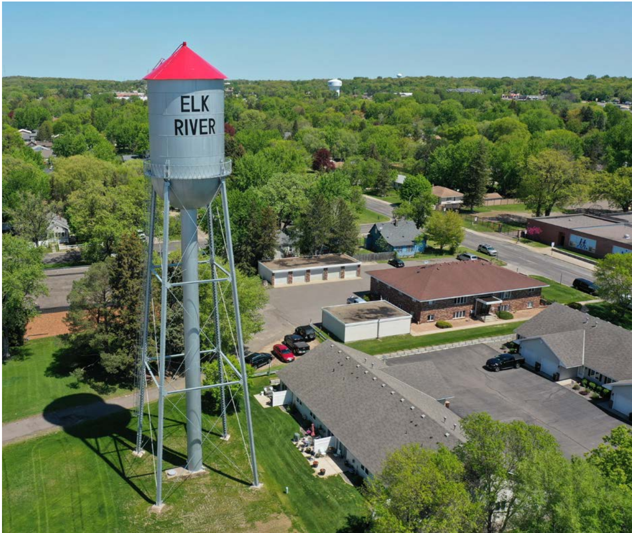
Above: Jackson Street Water Tower Restoration, Elk River.