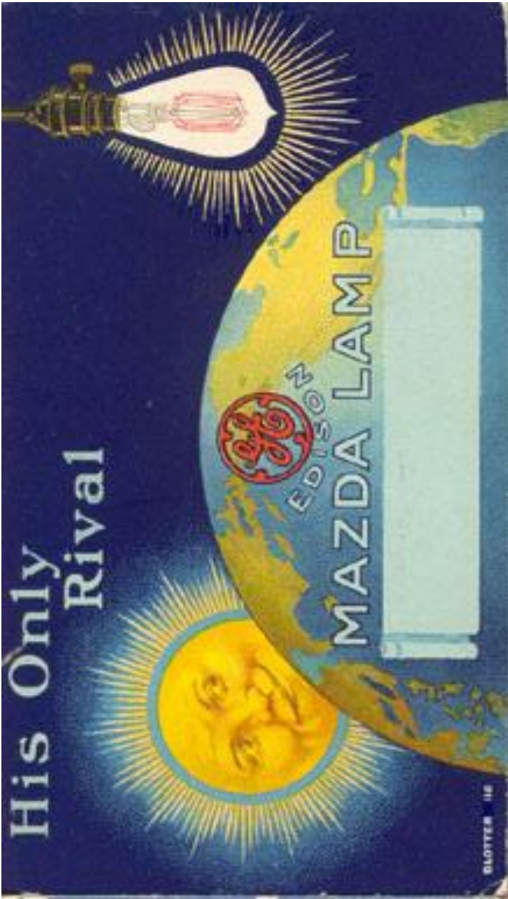
General Electric ad campaign ink blotter, early 1900s

A traveling exhibit from the Minnesota History Center and The Bakken Museum.